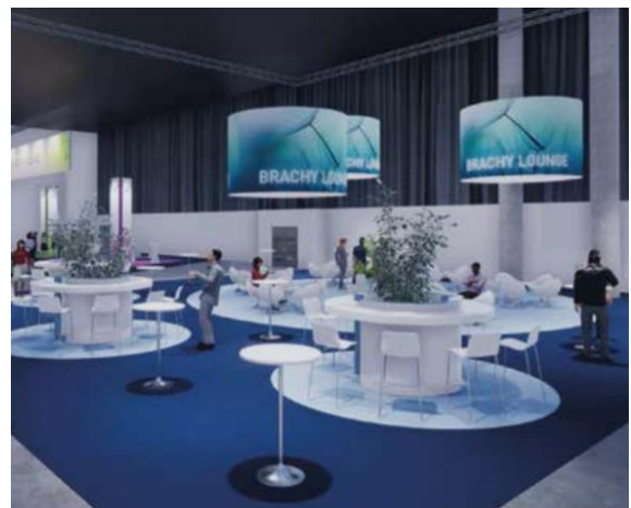
Renderings of the Brachy Village, designed by Karin Lundeborg © Sense Expo AB 2019