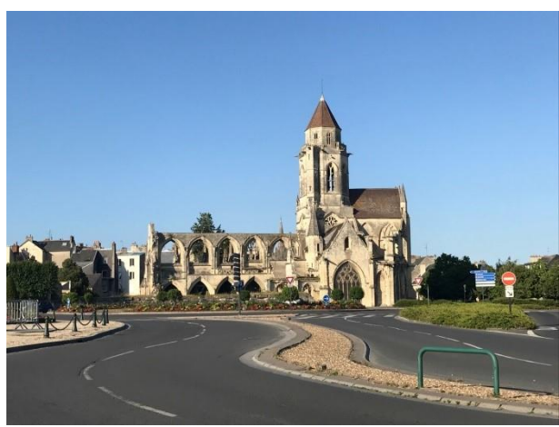
The meeting took place in beautiful Caen, where the participants could enjoy the incredible architecture of the city

Find out more about the various presentations and the latest reports on clinical trials at the meeting's website: https://indico.cern.ch/event/783037/timetable/#all.detailed